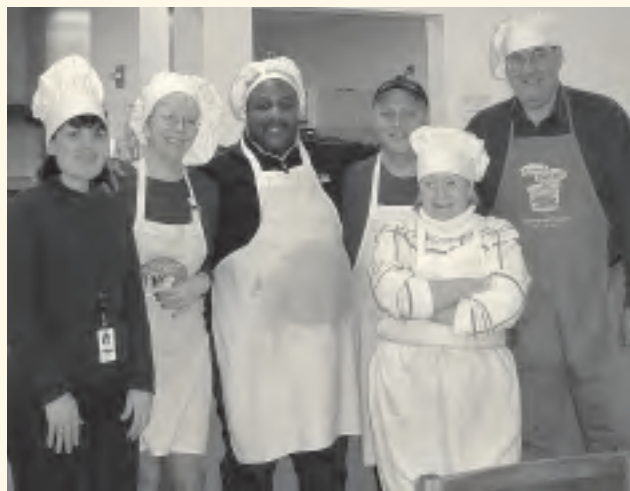
BCBS network management team who prepare and serve dinner each month at the Ramsey County Family Service Center