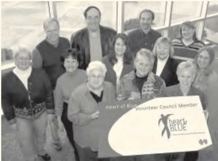
Members of the BCBS Volunteer Council

Blue Cross and Blue Shield of Minnesota Receives CVC Leadership Award