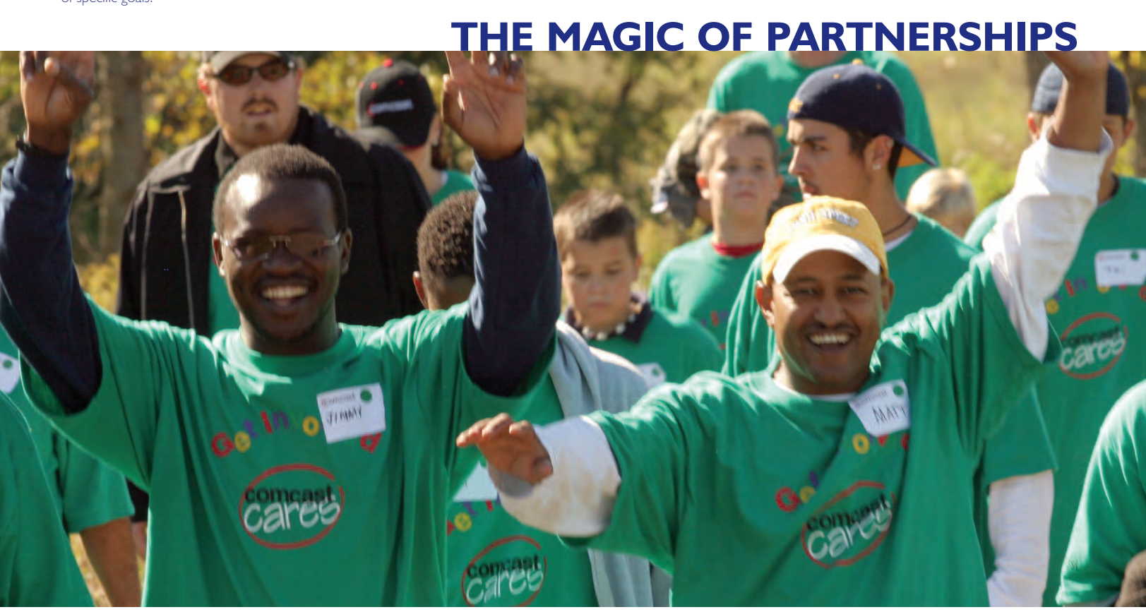
Corporate Volunteerism Council—Twin Cities Annual Report 2005

Working together to achieve success in an effort or venture within a relationship; a mutual cooperation and responsibility for the achievement of specific goals.